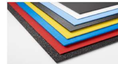
Plastics and Composites